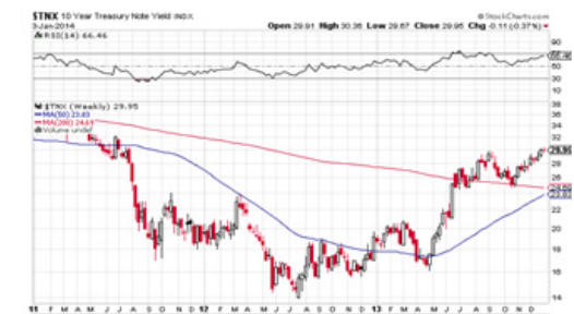
10-Year Treasury Note Yield, dated January 3, 2014